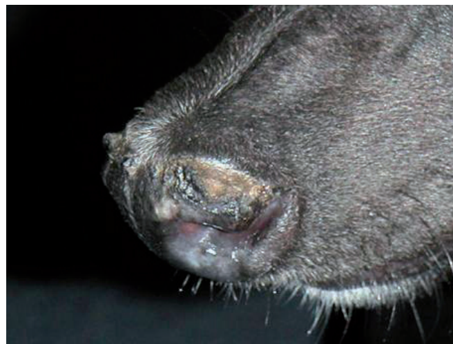
DLE starting to affect Cilla's nose with scabs forming.