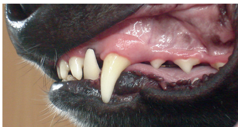
Top: Nasty teeth – showing definite signs of periodontal disease